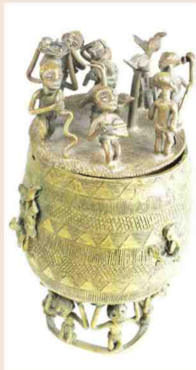
A GHANAIAN KUDUWO (gold dust container), 17th to 19th century. (Israel Museum)

To the left, we see crocodile masks used by the Grebo people in what is now Liberia during their secret initiations. Various masks, such as a wisdom mask used by the We people and a protection mask, are included in the exhibi-