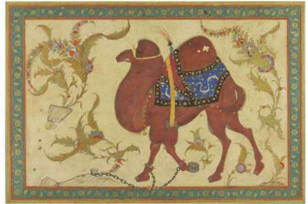
(Peter Lanyi/Israel Museum)